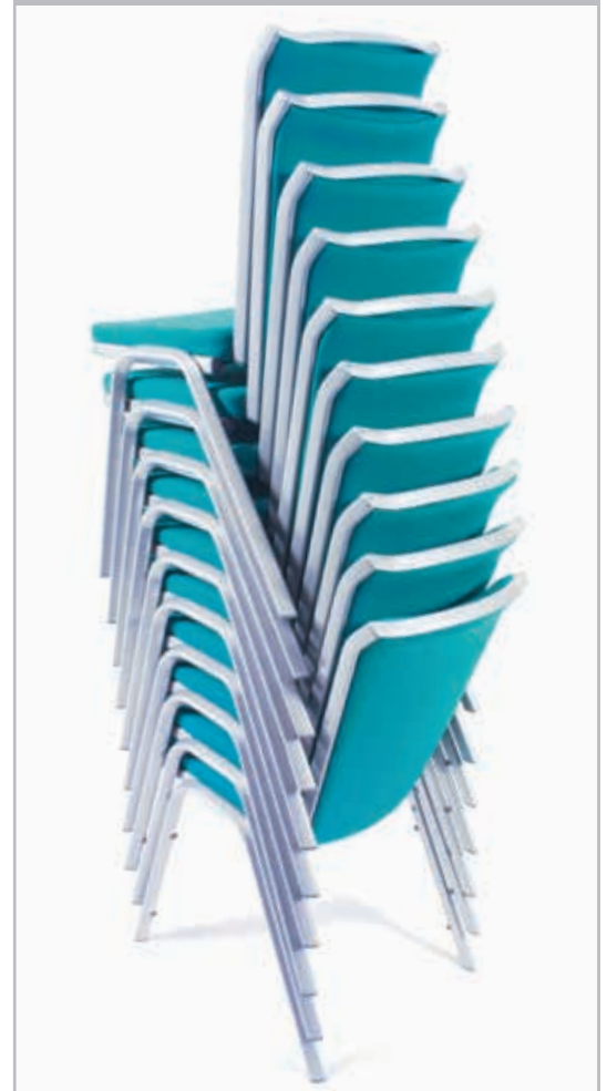
The chair can be stacked 12 high (visit our website to see our specially designed stacking trolley)