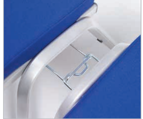
Option - Retractable linking