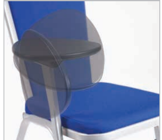
Accessory - Detachable tablet