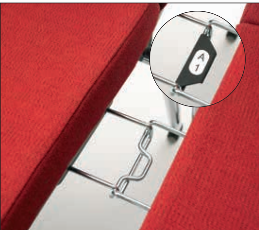
Option - Retractable linking with optional numbering

The chrome plated frame features a unique flared leg