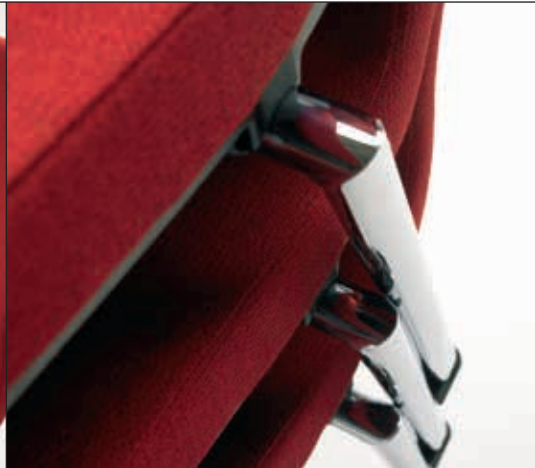
The unique foot stacking buffer allows the chairs to stack easily