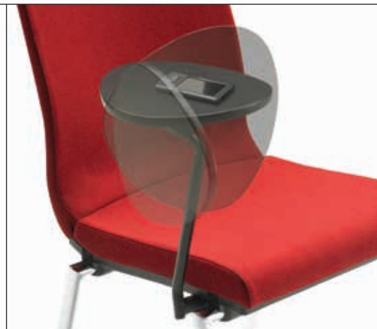
Accessory - Detachable tablet