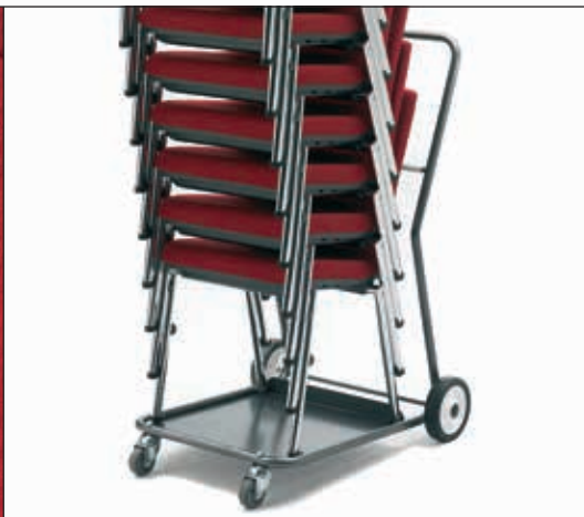
Accessory - The chair trolley can stack up to 10 chairs for easy handling and storage