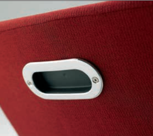
Option - Recessed handle fits snugly in the back of the chair